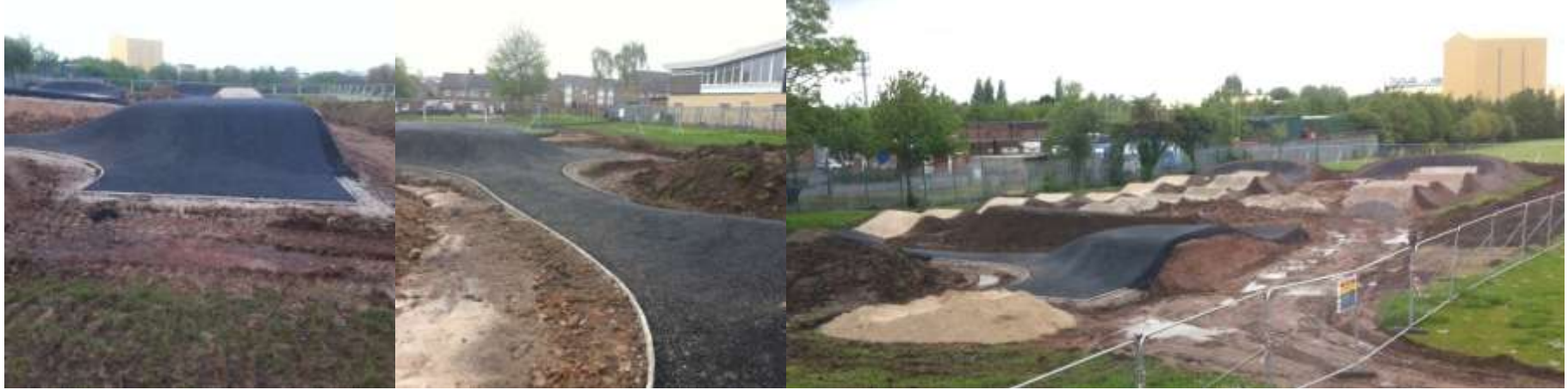
Projected completion date: Tuesday 20th May 2014. Track finished on Tuesday 20th May 2014 . . . . Result !